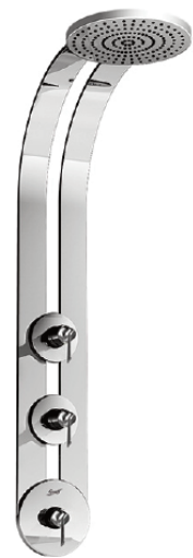
Thermostatic Valve Shower

enabling you to use less energy and less water for a longer, more luxurious bath.